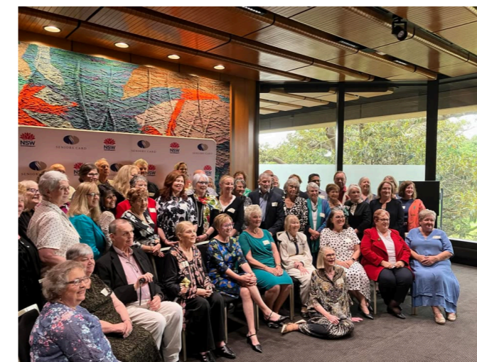
The Seniors' Story Team gathering for the commemorative photo at Old Parliament, Sydney NSW