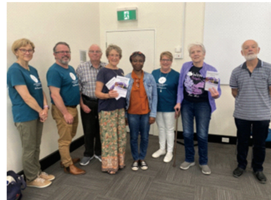
FAW and DFC members at the launch of "Unforgettable Voices"

the stories which were touching and a grim reminder of part of why we write – to document and keep memories alive.