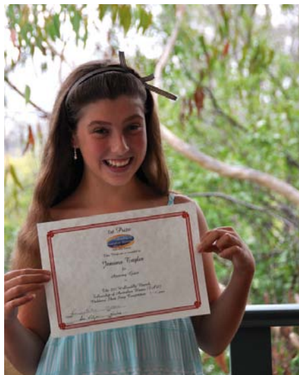
At the WOLLONDILLY FAW Children's Short Story prize-giving day at Picton (story next page)...

Wendy Zirngast, our volunteer editor, continues to make great progress with the latest book now to be titled Ripples . No doubt, Ripples will be extremely popular with the young target audience and the illustrations we have seen are a