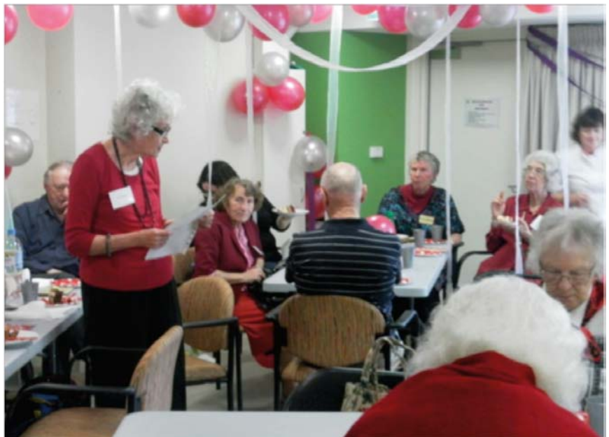
The Blue Mountains branch celebrates 40 years of Fellowship

For more information visit the Book Expo Australia website: <www.bookexpoaustralia.com>