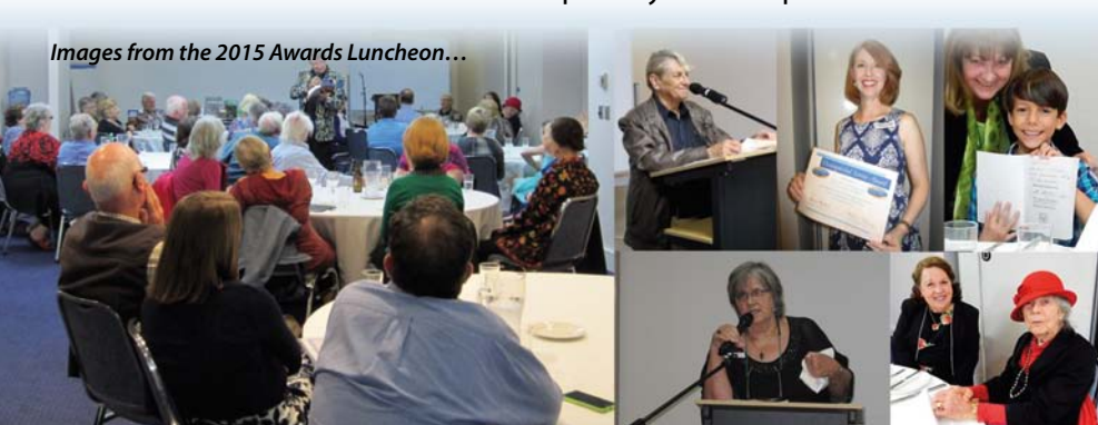
Images from the 2015 Awards Luncheon...