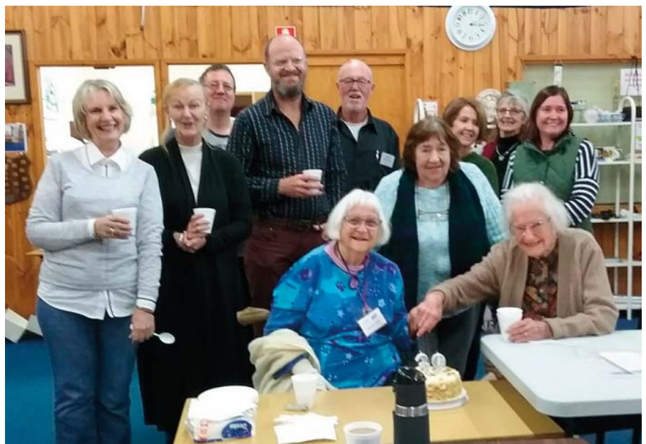
Cutting the cake to celebrate the 39th anniversary of Port Macquarie-Hastings branch.