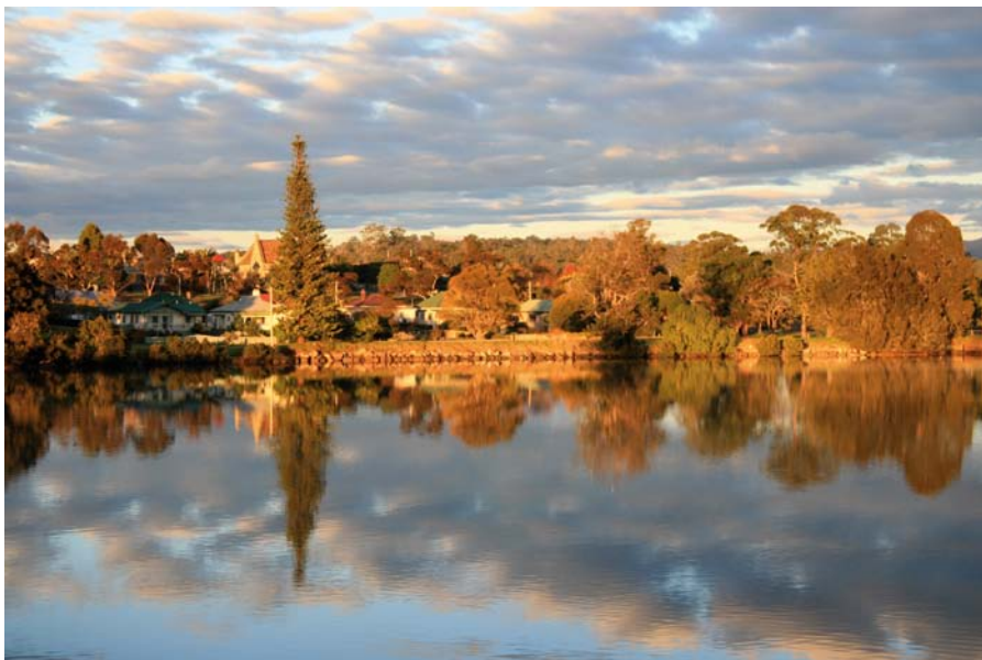
Moruya River and Town.

Luhana Motel, 82 Princes Hwy (cnr Ford St), Moruya Monarch Hotel/Motel, 50 Vulcan St (Princes Hwy), Moruya Bryn Glas, 19 Valley View Lane (self-contained accomm 6 mins drive Moruya) Moruya Motel, 2474 Princes Hwy (1.5 km north of Moruya) Moruya Heads East's Dolphin Beach Holiday Park, South Head Rd (6 km) Post and Telegraph B&B, cnr Page and Campbell Sts, Moruya Moruya Waterfront Hotel/Motel, 1-5 Princes Hwy, Moruya